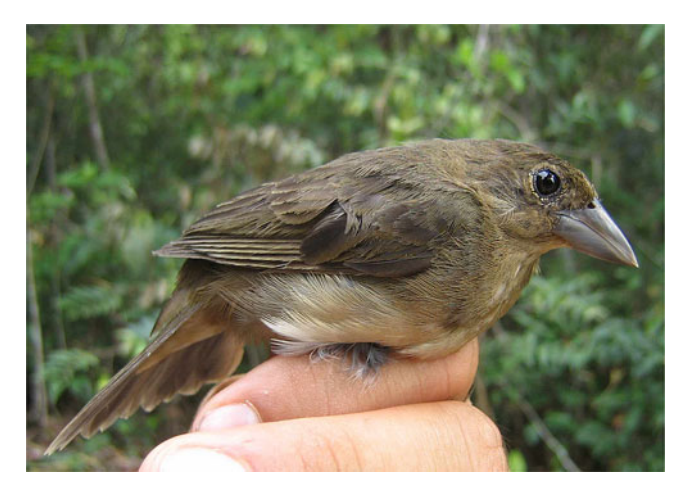
Figure 3. Female Cone-billed Tanager Conothraupis mesoleuca from the upper Juruena river, captured at site 13 (Fig. 1C), Sapezal, Mato Grosso, Brazil.

Although the Cone-billed Tanager is strongly responsive to playback (CCG and LFS pers. obs.), it was found in only 14 of 146 playback sampling points. We believe that this could suggest low population density. However, accurate population size estimation will require even more intensive effort in the appropriate habitat types. Here we found around 40 individuals (see