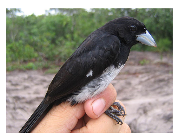
Figure 2. Male Cone-billed Tanager Conothraupis mesoleuca from the upper Juruena River, captured at site 11 (Fig. 1C), Sapezal, Mato Grosso, Brazil. Note the slight rictal commissure and the dark coloured bill tip.

forest or scrub" (Berlioz 1946, Storer 1960), or "bushy vegetation among dry forest" (Isler and Isler 1987). These earlier descriptions suggest cerrado , which is the dominant physiognomy of the Chapada dos Parecis. Thus, if the species really selects flooded areas, those habitat descriptions may have delayed the rediscovery of the species by leading researchers to look in the wrong habitats (Buzzetti 2006).