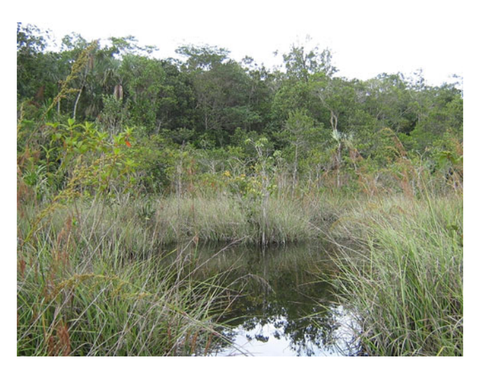
Figure 4. Flooded grassland with scattered shrubs and Moriche Palms Mauritia flexuosa in Juruena riverside (site 12 in Figure 1C).

Appendix 1), but several areas of potential suitable habitat exist in the Chapada dos Parecis that have not yet been visited by ornithologists; therefore population size could be larger. These areas, comprising a mosaic of private and indigenous lands, are prime targets for new surveys (see discussion).